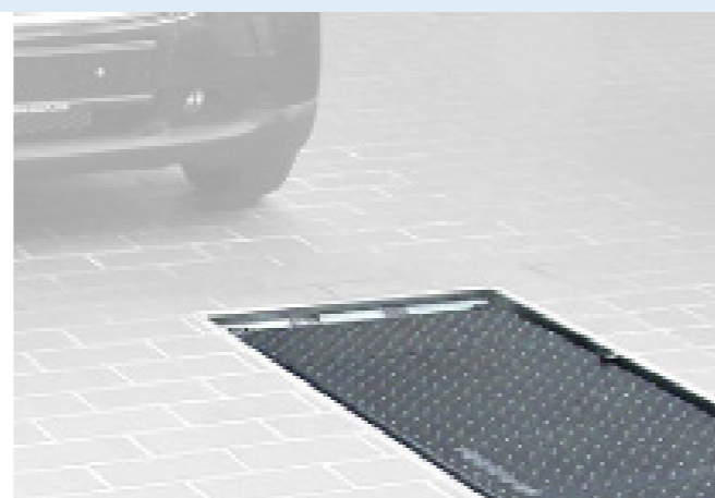
In-ground or above ground installation