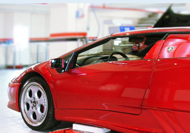
Very flat construction: Perfect for sports cars