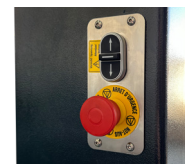
Control unit on both columns