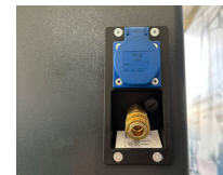
Energy Set with pressured Air and 230 V socket