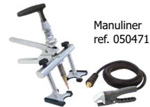
Manuliner ref. 050471