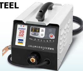
EASYLINER 39.02 - ref. 053618